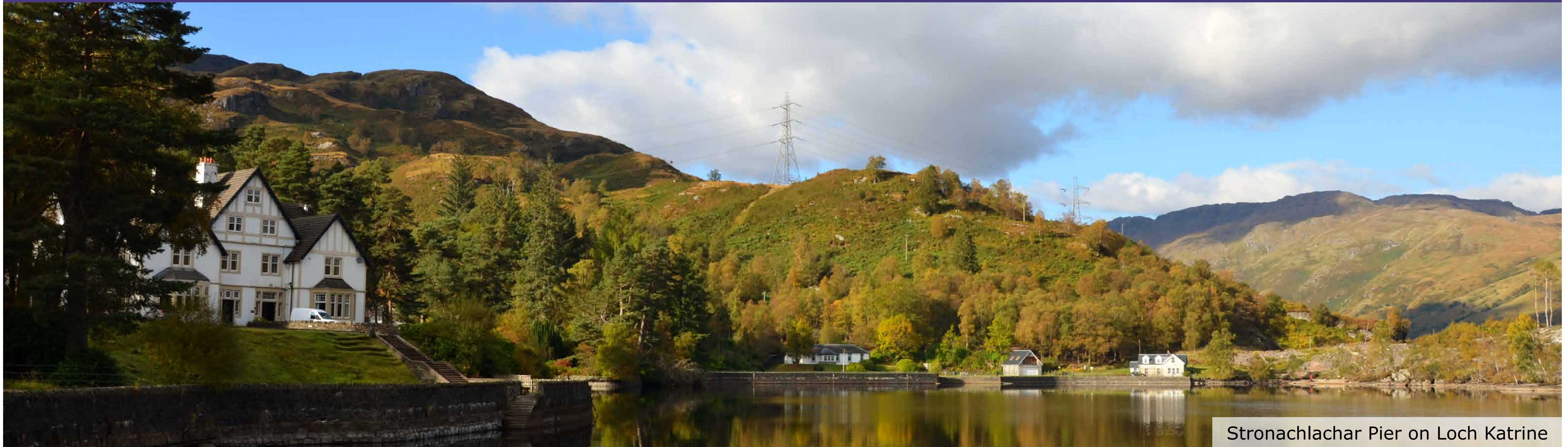
Stronachlachar Pier on Loch Katrine