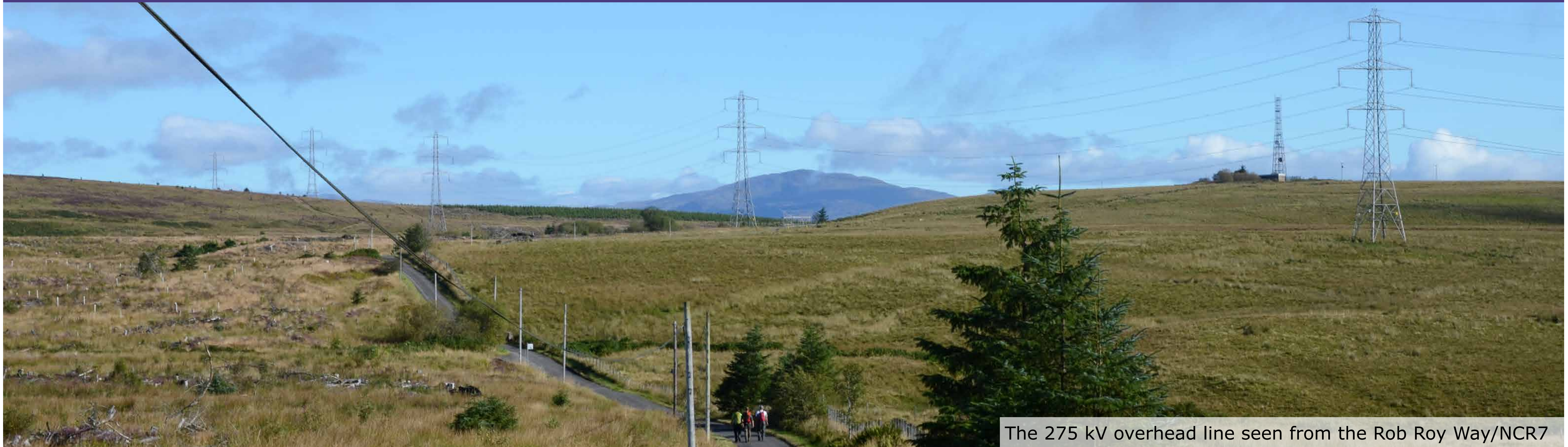
The 275 kV overhead line seen from the Rob Roy Way/NCR7