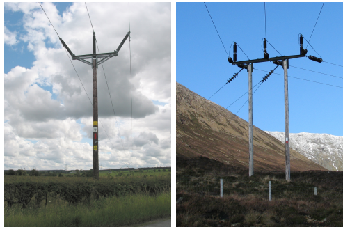
Trident Design Single Pole (left) & 'H' Pole (right)

For the 'H' pole configuration, the height will again be between 10m and 22m, and span lengths will vary depending on topography and altitude, with poles being closer together at high altitudes to counteract the effects of greater exposure to wind and weather events. The height and distance between poles will be determined after the detailed line survey.