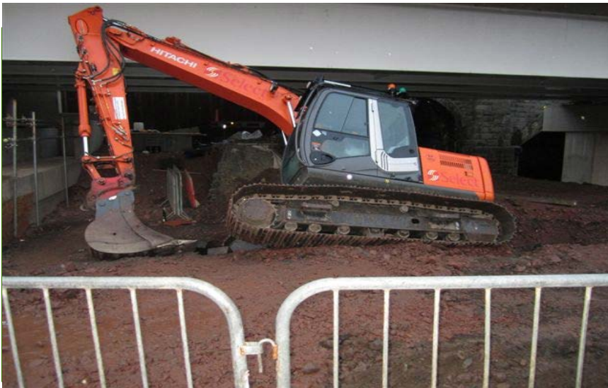
Excavator partially overturned

The above image highlights an incident where an excavator partially overturned whilst crossing over an excavated track, in the process of attempting to recover the situation, damage to 2 high voltage cables occurred when the excavator tracks came into contact with the underground electrical network. Prior to crossing an open track with an excavator a risk assessment is recommended to establish the ground conditions at the locus for stability. To ensure best practice when an excavator is required to cross over a track, there should be a designated crossing point, which has previously been backfilled to ensure safe passage.