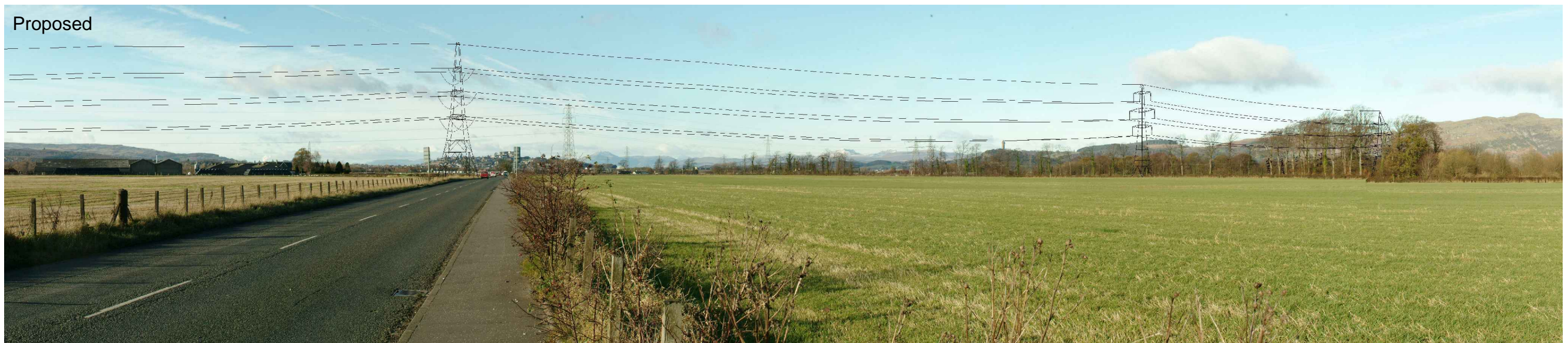
Fallin looking north (ES Viewpoint 100A Figure 24.1-100A)

Note: Towers and conductors as proposed are represented by a graphic model and are not true visual images