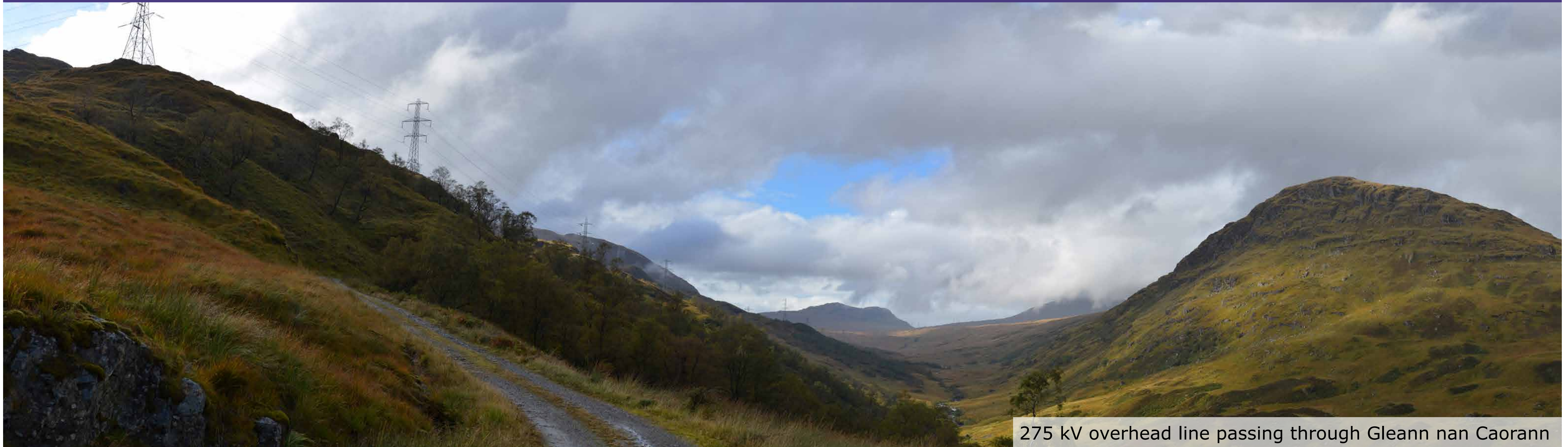
275 kV overhead line passing through Gleann nan Caorann