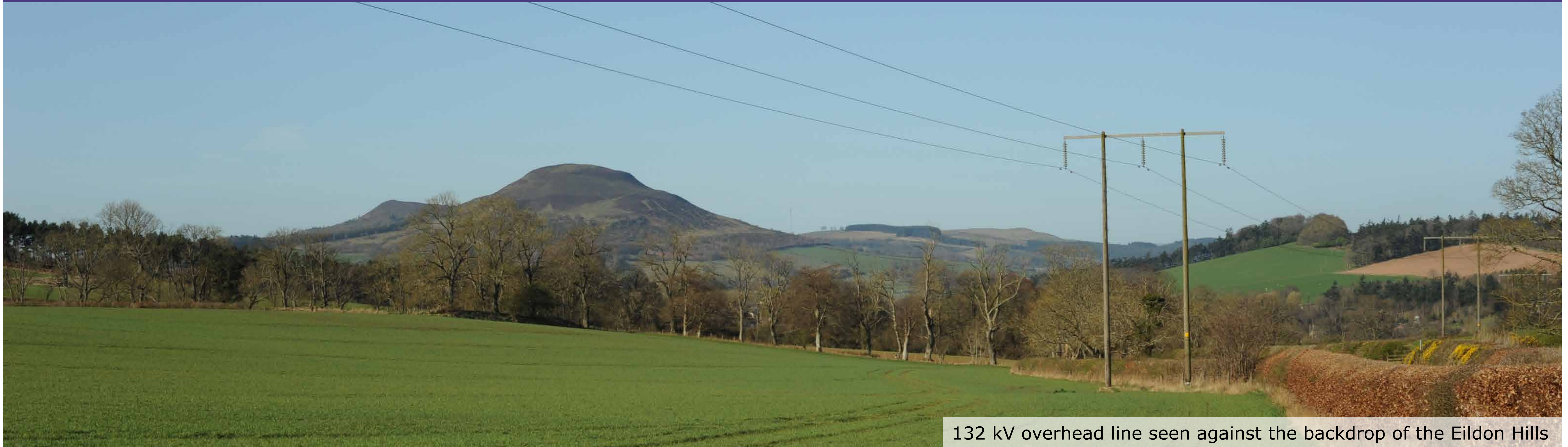
132 kV overhead line seen against the backdrop of the Eildon Hills