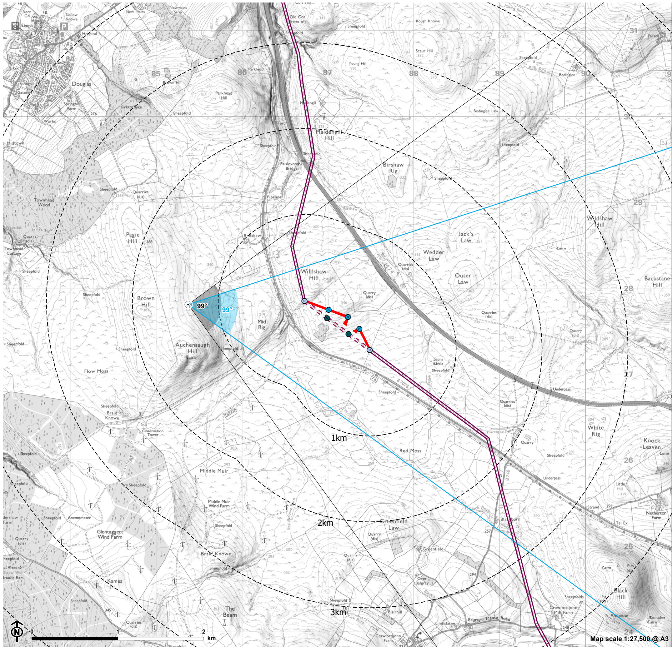
Figure 7.4: CHVP3 Auchensaugh Hill, enclosure (10054)