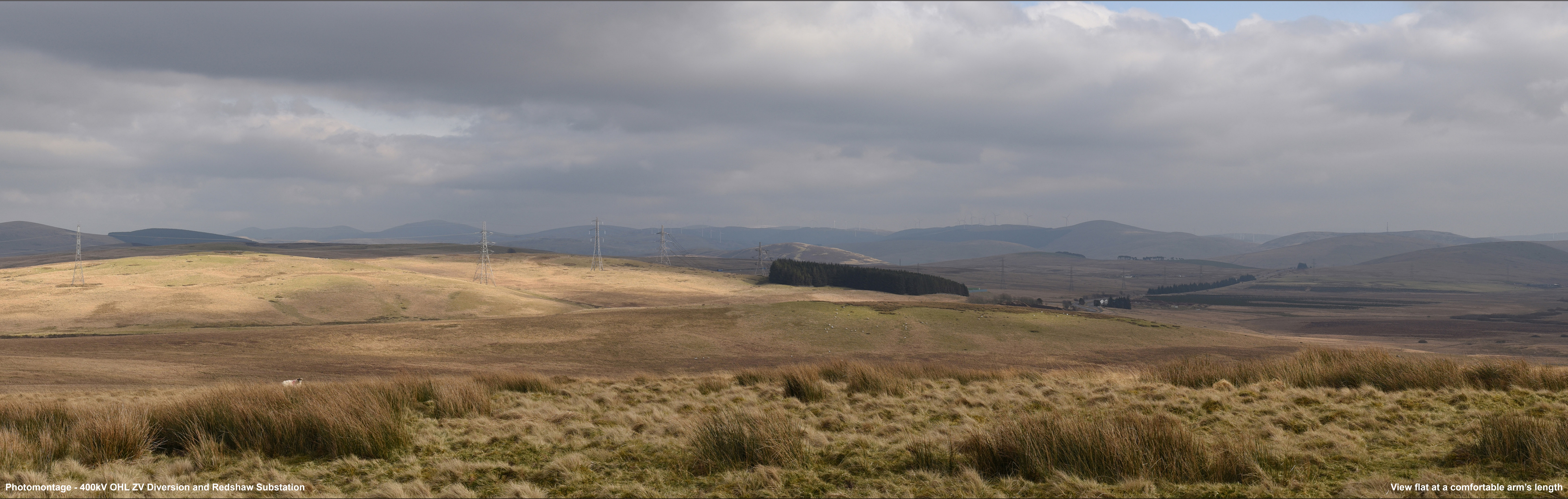
Photomontage - 400kV OHL ZV Diversion and Redshaw Substation