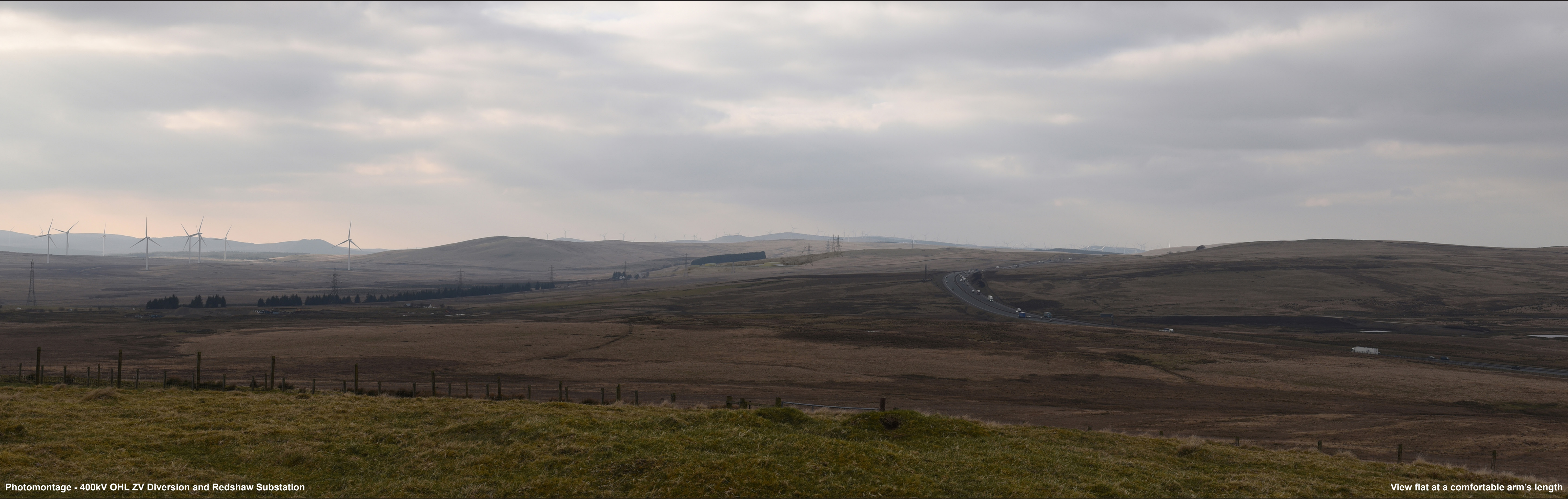
Photomontage - 400kV OHL ZV Diversion and Redshaw Substation