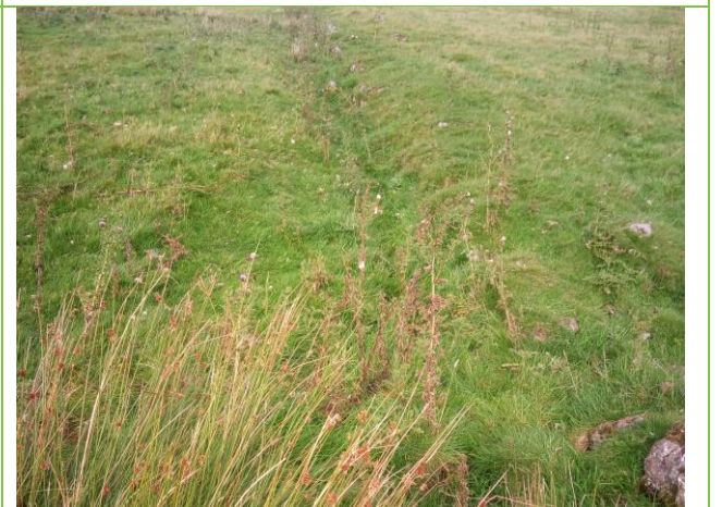
Watercourse crossing #21 facing upstream