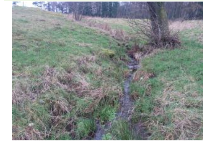
Watercourse crossing #4 facing upstream