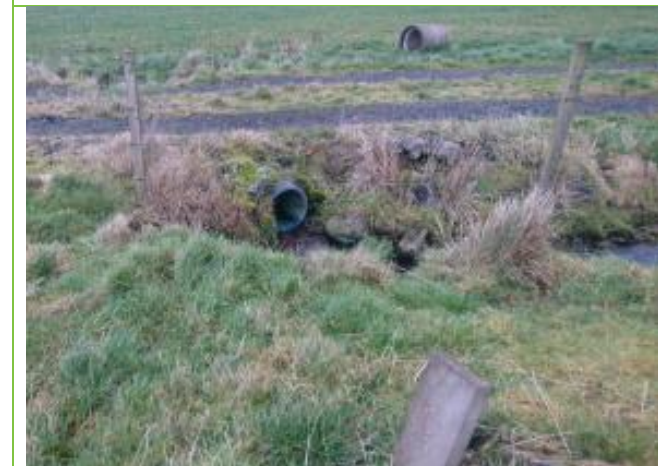
Watercourse crossing #14 facing downstream