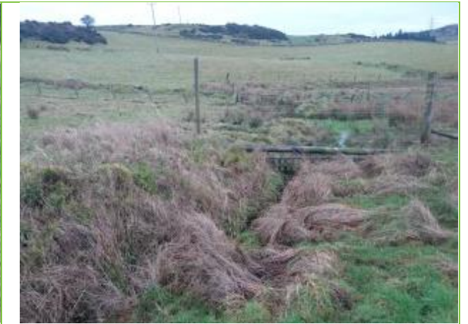
Watercourse crossing #7 facing upstream