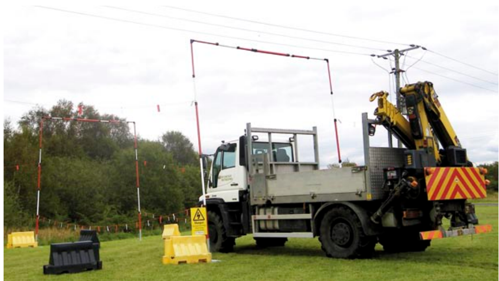
Figure 5 Minimum heights above ground level for overhead power lines