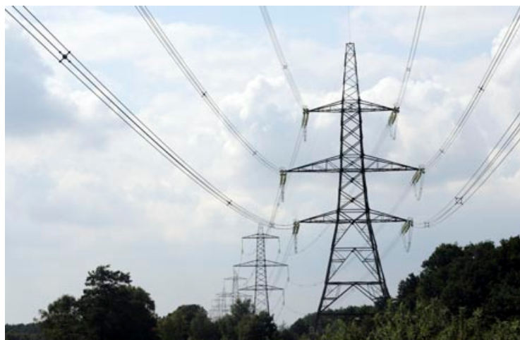
Figure 1 275 kV transmission line

6 Most overhead lines have wires supported on metal towers/pylons or wooden poles – they are often called ‘transmission lines’ or ‘distribution lines’. Some examples are shown in Figures 1–3.