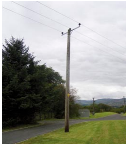
Figure 2 11 kV distribution line