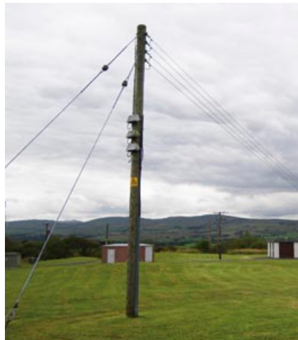
Figure 3 400 V distribution line

7 Most high-voltage overhead lines, ie greater than 1000 V (1000 V = 1 kV) have wires that are bare and uninsulated but some have wires with a light plastic covering or coating. All high-voltage lines should be treated as though they are uninsulated. While many low-voltage overhead lines (ie less than 1 kV) have bare uninsulated wires, some have wires covered with insulating material. However, this insulation can sometimes be in poor condition or, with some older lines, it may not act as effective insulation; in these cases you should treat the line in the same way as an uninsulated line. If in any doubt, you should take a precautionary approach and consult the owner of the line.