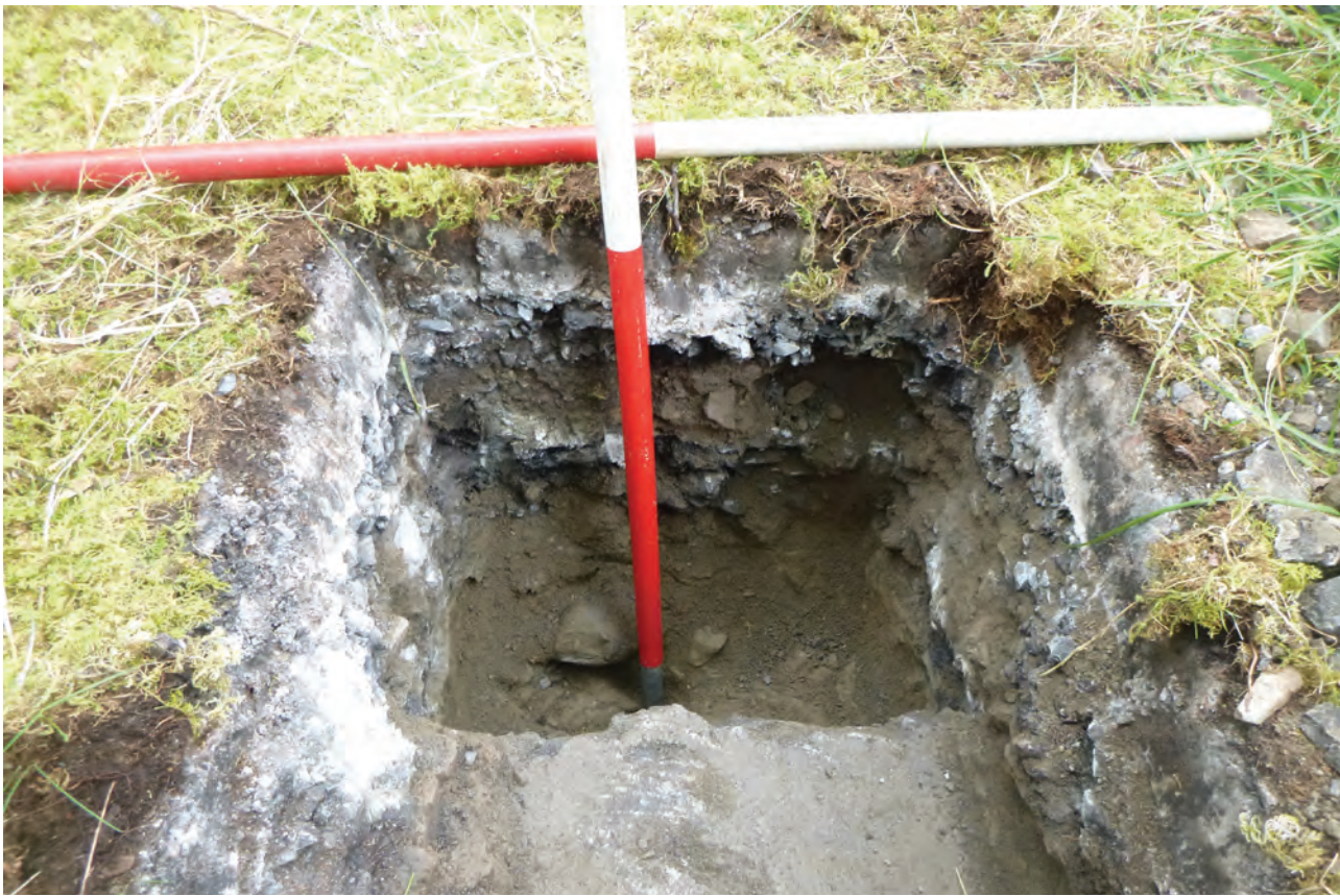
Fig. 10: Trial Pit 2