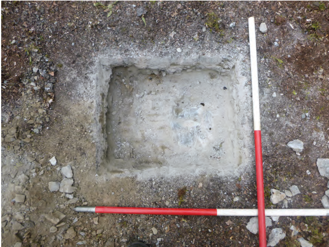
Fig. 9: Trial Pit 1