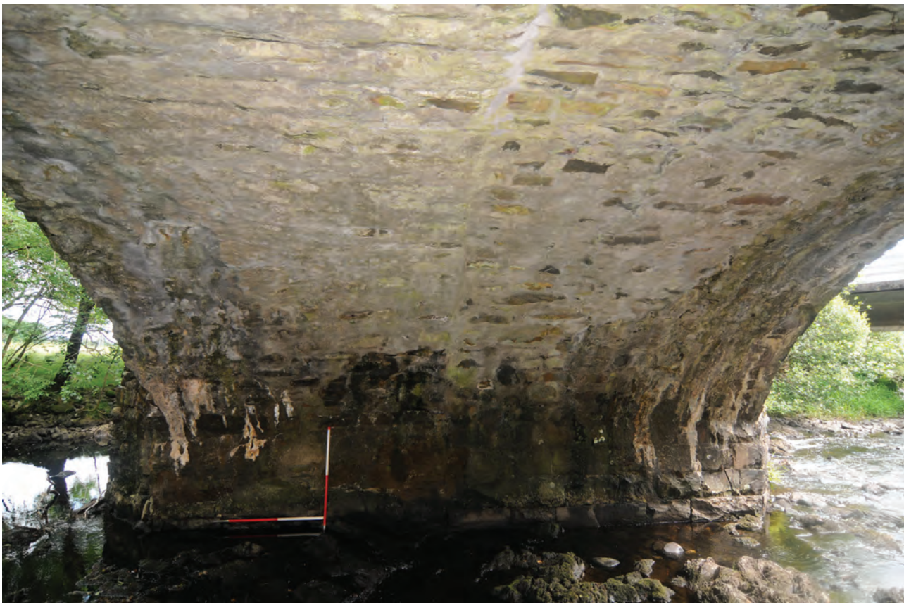
Fig. 6: Construction line running round the barrel vault marking the junction between the early and later construction