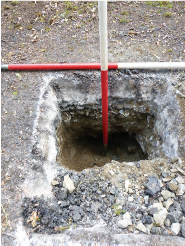
Fig. 14: Trial Pit 6