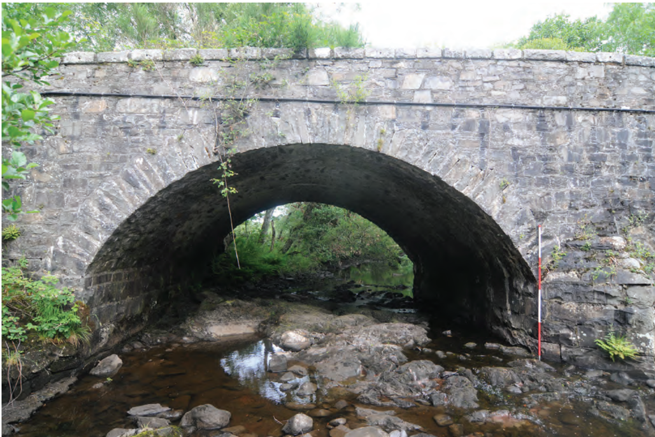
Fig. 4: South spandrel arch seen from the west