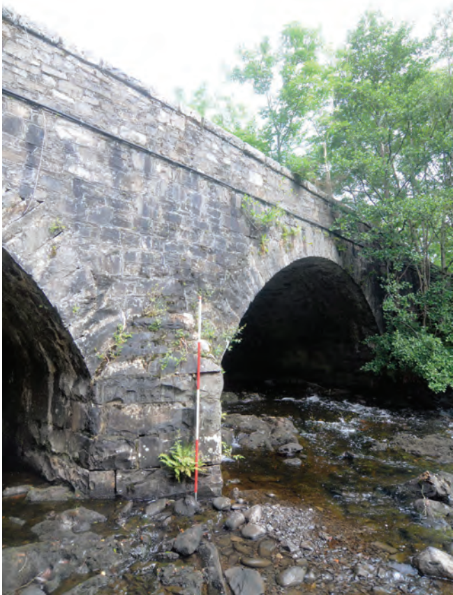
Fig. 3: Buttress detail between the two main arches on the east-facing elevation