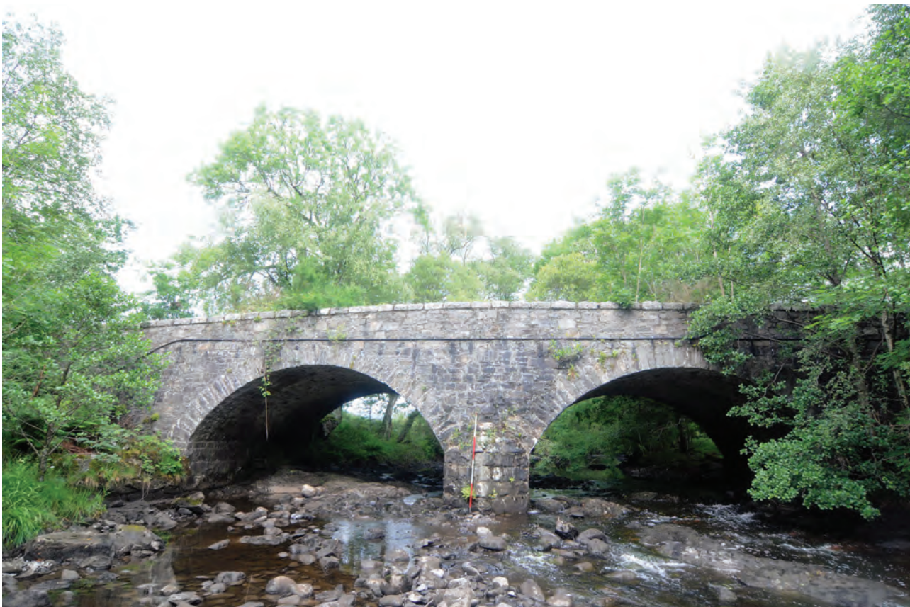
Fig. 2: The bridge in its topographical setting, east-facing elevation