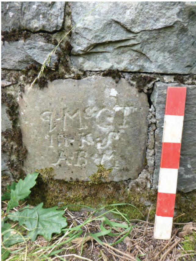
Fig. 7: 18th century commemorative stone inscribed q-Mc Clirlk S A B M