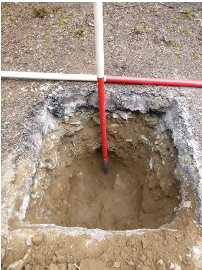
Fig. 12: Trial Pit 4