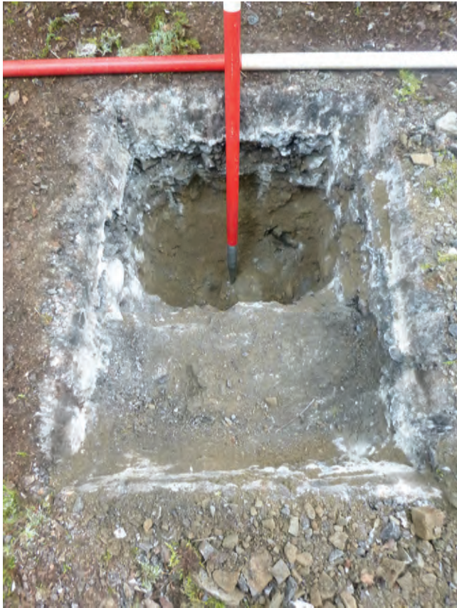
Fig. 11: Trial Pit 3