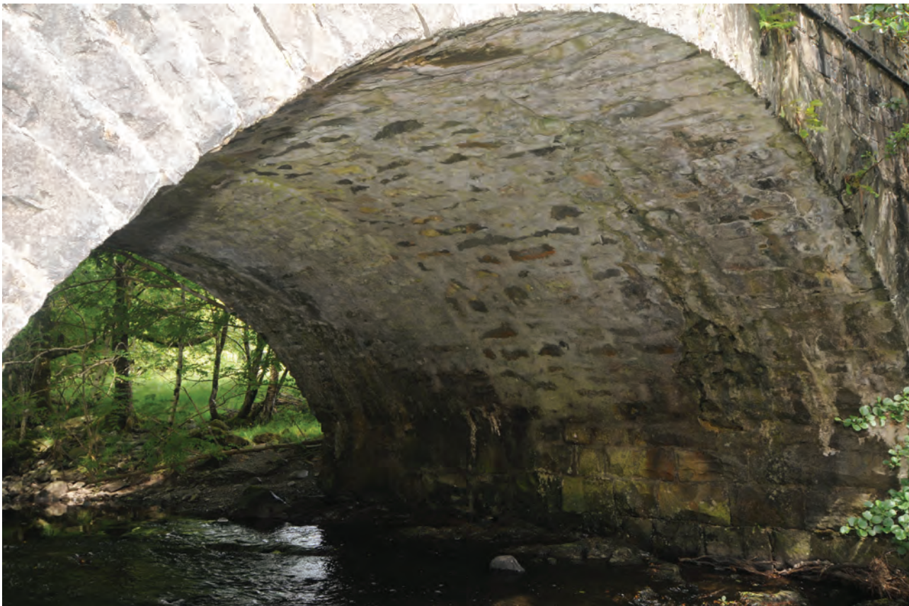
Fig. 5: Interior view of the arch showing two phases of construction