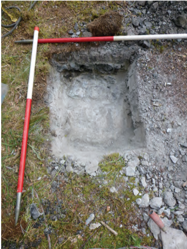
Fig. 13: Trial Pit 5