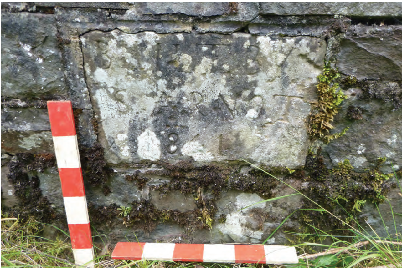
Fig. 8: Date stone inscribed Built by S Arnot AD 1841