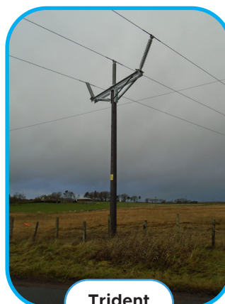
Trident Wood Pole

Following careful environmental planning, the route shown above has been selected as the preferred route option as it minimises potential effects on both people and the environment. We are now seeking your views. Involving local communities is very important to us, as it helps identify any issues and address concerns at an early stage. More information on the project and the preferred route is available on the project website, which also explains how you can provide your feedback.