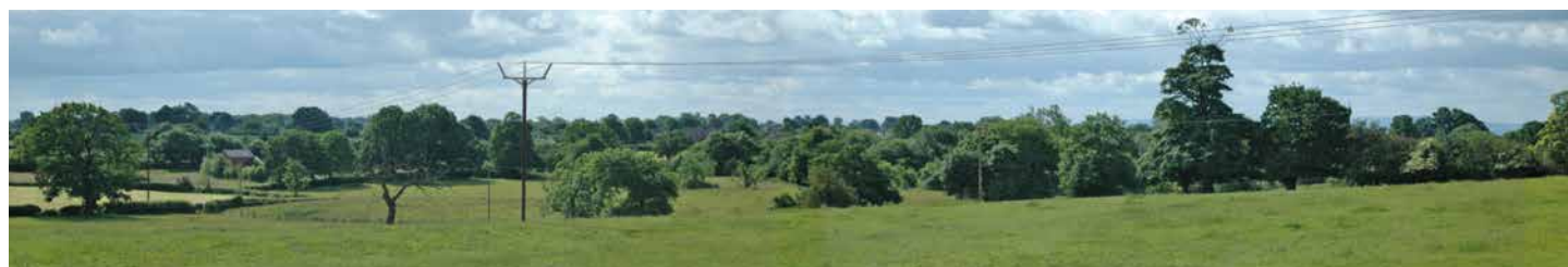
Proposed view (artist's impression)