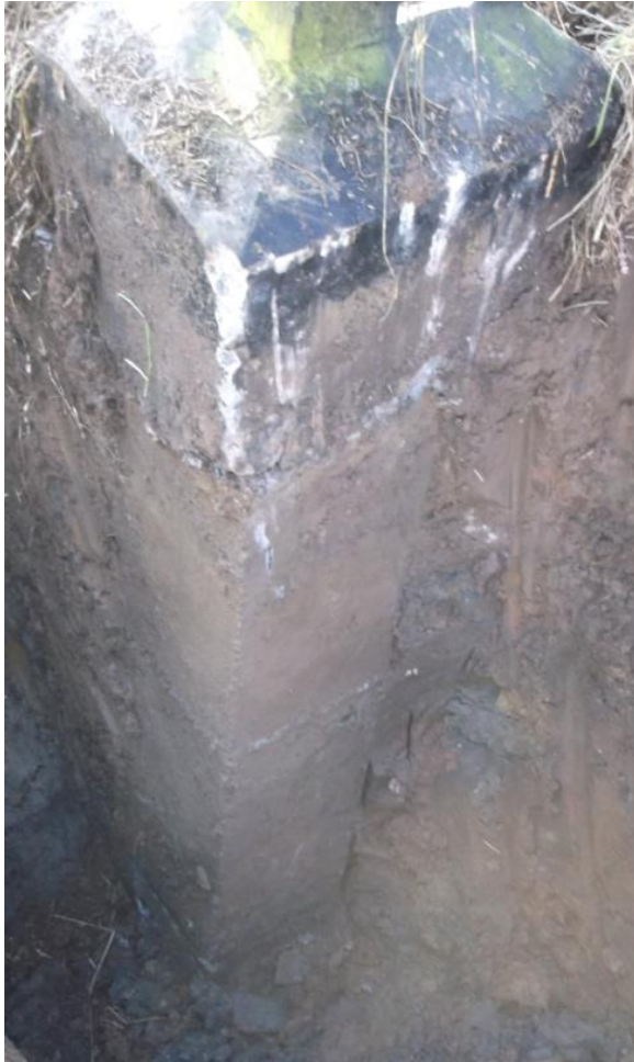
BL006 Tower Foundation – no pyramid

BL route tower steelwork condition from towers (BL001 - BL071) is considered to be of an adequate condition; however foundation intrusive inspection carried out on 3 towers (BL006, BL035, BL037) presented absence of pyramid on towers BL006 and BL037 and significantly smaller dimensions when compared to original foundation records for this type of structures.