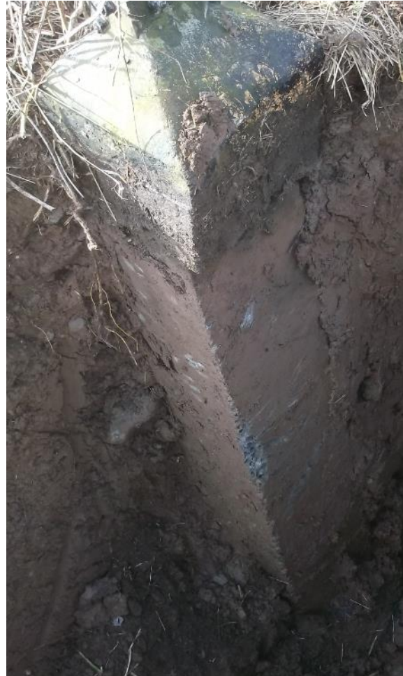
BL037 Tower Foundation – no pyramid