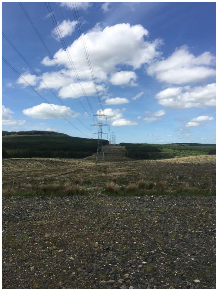
View of the recently installed 275kV WA Overhead Line between Coylton and New Cumnock substations